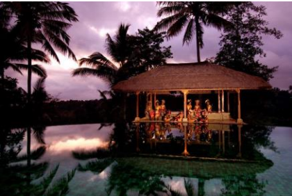
Golden Pavilion – Amandari

Company Name : Asia World Indonesia Tour Name : 5 DAYS BALI DISCOVERY Tour Dates : 20 – 24 April 2015