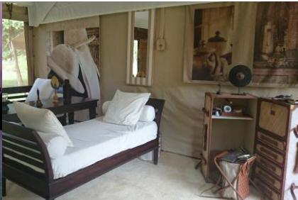
A corner in Semana's tent