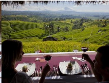
Jatiluwih rice terrace lunch